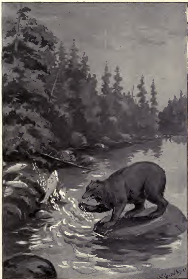
THE BEAR FISHING.